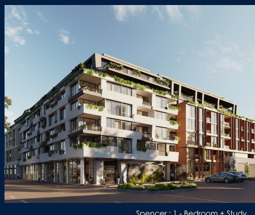
Spencer: 1 - Bedroom + Study