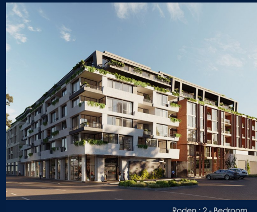
Roden: 2 - Bedroom