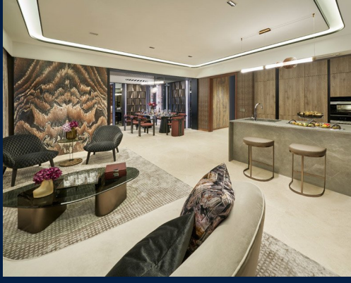
5 - Bedroom Premium