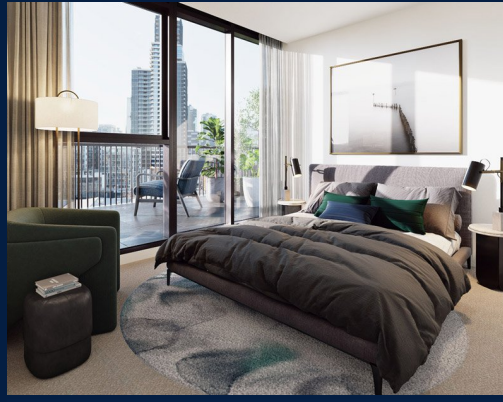
Roden: 3 - Bedroom