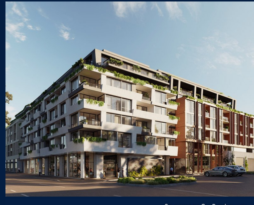
Spencer: 2 - Bedroom